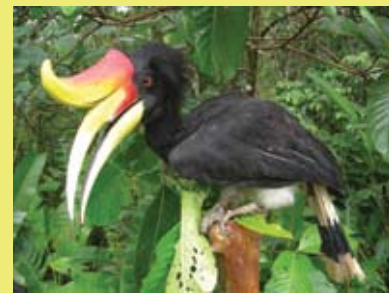
Maklamin Lakim/Sabah Parks

The Rhinoceros Hornbill ( Buceros rhinoceros ) is one of the largest flying birds in the tropical rainforest. Locally known as the 'Enggang Badak', it is characterised by the presence of a uniquely-shaped casque on top of its head that resembles the horn of a rhinoceros, from which its name is derived. A resident of South Thailand, Peninsular Malaysia and Borneo, distribution of this species spans across lowland and lower montane rainforests. Adult birds usually weigh an average of 2,655g with a wing span of 150cm. Although it mainly feeds on fruits, it also sometimes feeds on small animals from insects, snails to snakes and lizards.