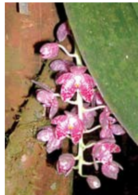
Elephant's ear orchid

The terrain within the Park is quite rugged and hilly, with altitudes ranging from 30m to 1,312m at its highest point. There are three main peaks in the form of extinct volcanoes which were last active about 27,000 years ago. These are Mt. Magdalena (1,312m), Mt. Lucia (1,202m) and Mt. Maria (1,083m). Trails to climb Mt. Magdalena and Mt. Lucia were recently completed in 2006 and will soon be opened to visitors.