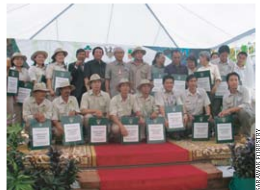
Group photo of the first batch of park guides at the launching of the Park Guiding and Licensing System in Mulu National Park, Sarawak

The core syllabuses for the 'Certificate in Park Guiding Course' are theoretical knowledge on tourism and ecotourism, Totally Protected Areas (TPAs) and biodiversity conservation, national parks and nature reserves as tourism products, risk management in national park and nature reserves and principle of thematic interpretation. Those keen in taking up park guiding as a career must undergo and complete this intensive skill-training programme. The curriculum is specially tailored to meet the demands of providing guiding services in our national parks and nature reserves.