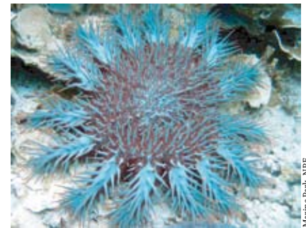
'Mahkota berduri' (crown of thorns)

Ekspedisi 'Reef Clean Up 2007' telah diadakan pada 25-27 Mei 2007 di Taman Laut Pulau Aur dan Pemanggil, Mersing Johor. Program ini merupakan program tahunan Jabatan Taman Laut, Malaysia, dalam usaha meningkatkan kesedaran awam dan konservasi marin melalui aktiviti-aktiviti selaman seperti membersihkan dasar laut daripada sampah, mengutip pukat hanyut yang tersekat di batu karang dan memungut tapak sulaiman 'mahkota berduri' yang merupakan musuh semulajadi batu karang. Seramai 20 orang penyelam sukarela dan kakitangan Jabatan Taman Laut menyertai ekspedisi kali ini. Ekspedisi kali ini amat berjaya dengan pungutan 'mahkota berduri' melebihi 200 ekor. Pada tahun lepas, pungutan COT di Pulau Aur dan Pemanggil berjumlah 1,049 ekor manakala pungutan tahun 2007 berjumlah 1,163 ekor.