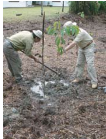
SARAWAK FORESTRY staff and MNS member join hands in planting a tree seedling

The Trees For Life Community Project was jointly organised by SARAWAK FORESTRY and Malaysian Nature Society (MNS) Kuching Branch to commemorate the global "7.7.07 Live Earth".