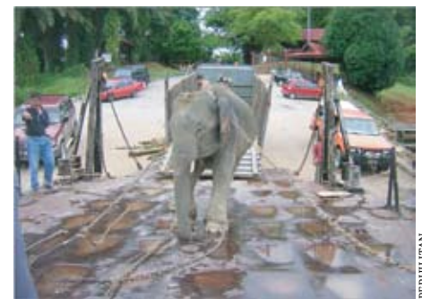
Bekok being relocated to Taman Negara Terengganu, using a barge to cross the Kenyir Lake

The whole translocation exercise was supported by the DWNP's two tame elephants. In addition to attracting visitors from all over the world, Taman Negara has been playing an important role in providing a safe refuge for the nation's endangered elephant in Peninsular Malaysia. However, DWNP, which is mandated to manage wildlife in Peninsular Malaysia and Taman Negara, has been cautious in relocating more elephants so as not to exceed the carrying capacity within the park. As part of the ongoing efforts to determine the status of biodiversity, including elephants at Taman Negara Terengganu, DWNP would be conducting a biodiversity inventory in August 2007 with the participation of some 60 external researchers.