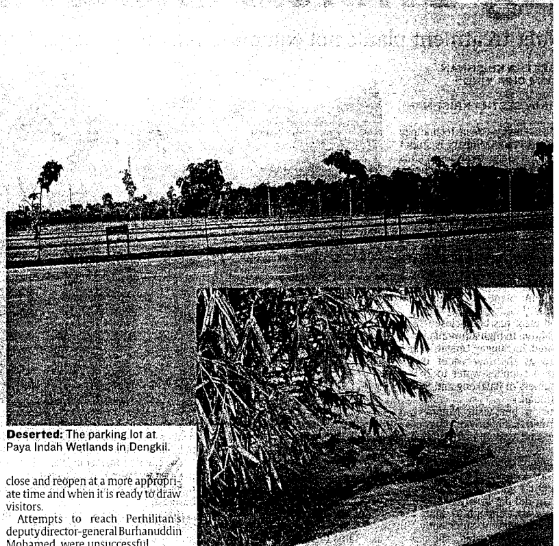
Deserted: The parking lot at Paya Indah Wetlands in Dengkil.

However, there seems to be so much yet to be done and the sanctuary might as well