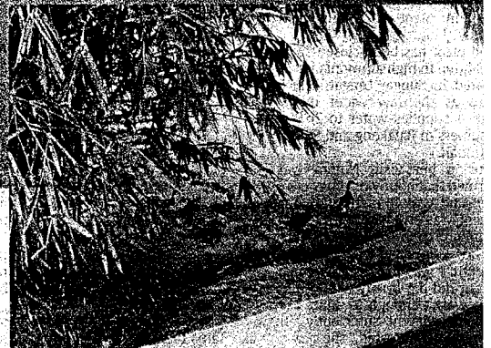
Pretty sight: Ducks taking shelter under some shady trees at the wetlands.