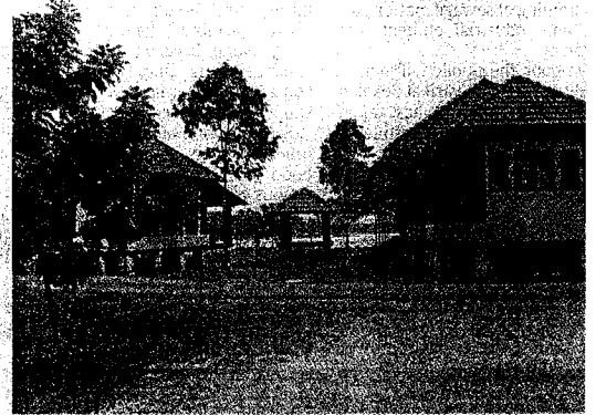
Attractive chalets: The accommodation for visitors is underused.